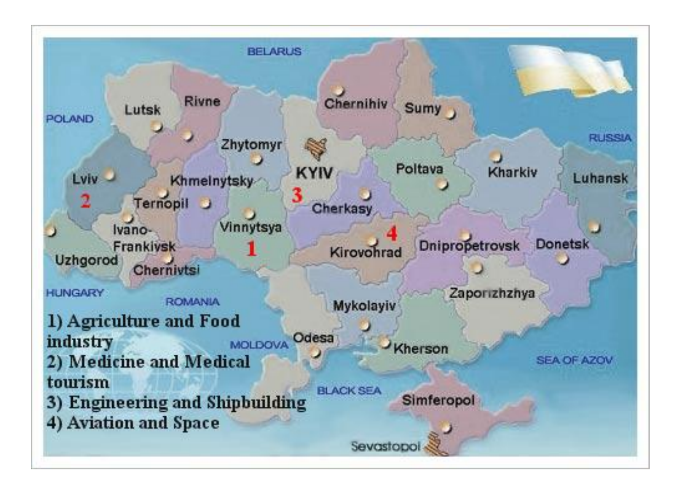
Figure 3. The location of the coordination centres of competence networks in Ukraine (project)

It is reasonable to assume that with the establishment of the initiative networks of competence, might occur the temptation to monopolize access to sources of financing due to the current position in the industry. So, in engineering and shipbuilding on the exclusive right to determine the branch of scientific-technical policy can claim Dnipropetrovsk, Kharkiv, Mykolaiv, Odessa, Kyiv. To avoid this from happening, it would be worthwhile to elect a new geographical location of the coordinating center of competence network. It is advisable to choose in the area of country center. Under this condition it will be easier to attract new personnel that will be difficult (if not impossible) in the traditional placement of the largest industrial enterprises and institutions.